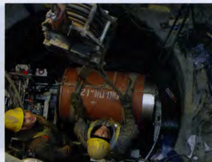
21-inch PTMT project, Edmonton, AB