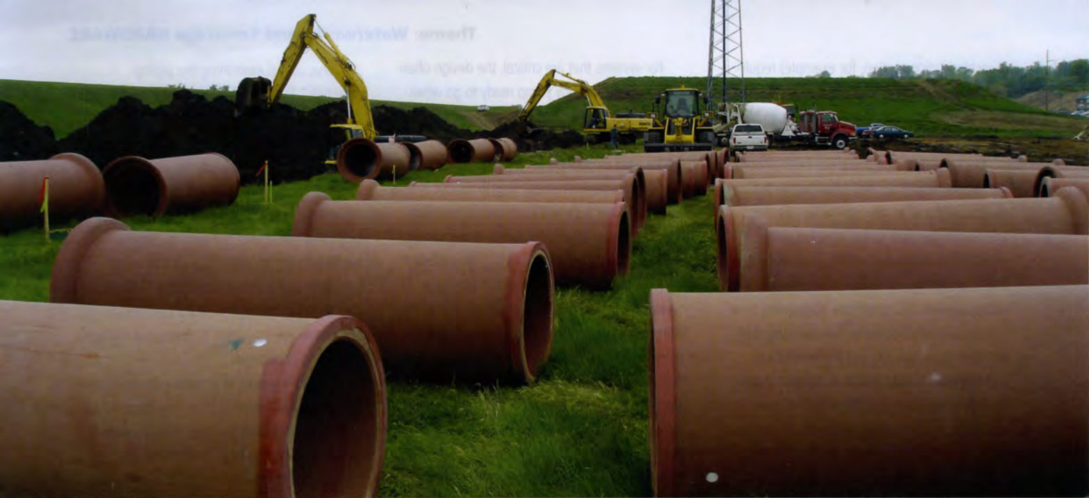
Above: 36-inch Bell and Spigot VCP (10 ft. joints), Sioux City, IA