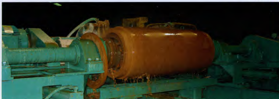
Jacking Pipe manufacturing