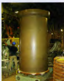
42-inch Bell and Spigot VCP Extrusion

precision tolerances after the vitrification process. The pipe ends are cut square to allow the axial jacking force to be uniformly transmitted from the jacking frame through each succeeding pipe section.