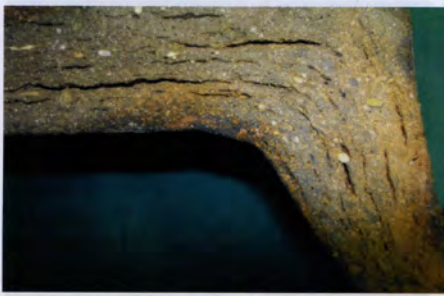
100+-year-old pipe wall with laminations created when the pipe was manufactured